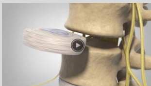
Degenerative Disc Disease (DDD)