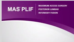
MAS PLIF Animation