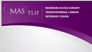
MAS TLIF Animation