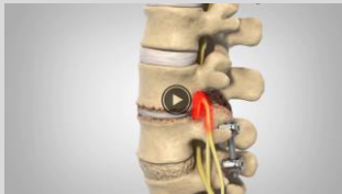
Adjacent Segment Disease (ASD)